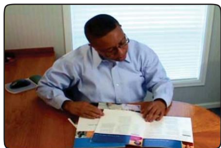
Thoroughly read insurance plans

Even though most plans pay only for basic services, we believe that you should be able to choose the most appropriate dental treatment for you and your family.